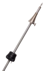
Interchangeable probe, 180 mm