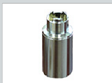
SigilBlock unlocking key