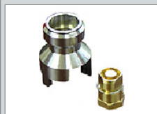
Patented tamperproof device