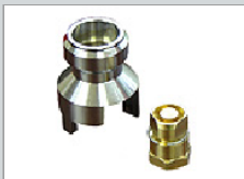
Patented tamperproof device